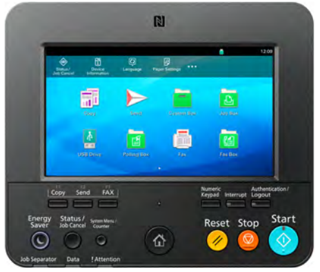
TASKalfa 508ci / 408ci / 358ci control panel