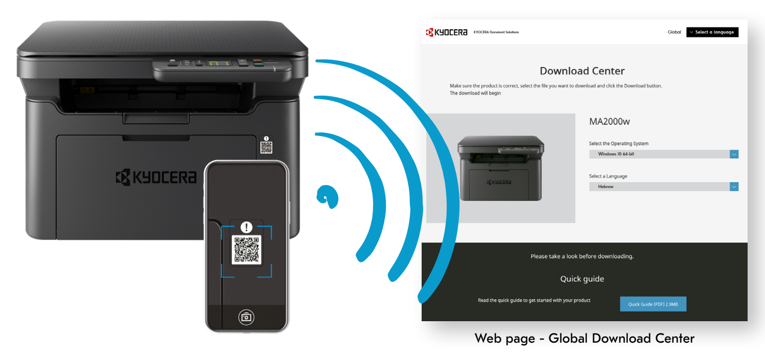
*Image is for illustrative purposes only. Descriptions may differ from the actual content due to page updates.

Our Kyocera online download center, accessible 24/7, provides support videos for product setups, drivers installations and access to our free Client Tool utility. For easy access to the website, you can simply scan the QR code that is on the front of the printer from any smartphone or tablet.